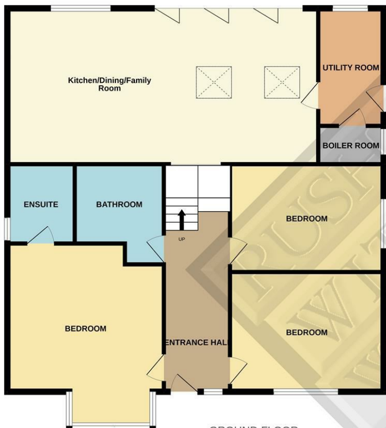
GROUND FLOOR 1278 sq.ft. (118.7 sq.m.) approx.